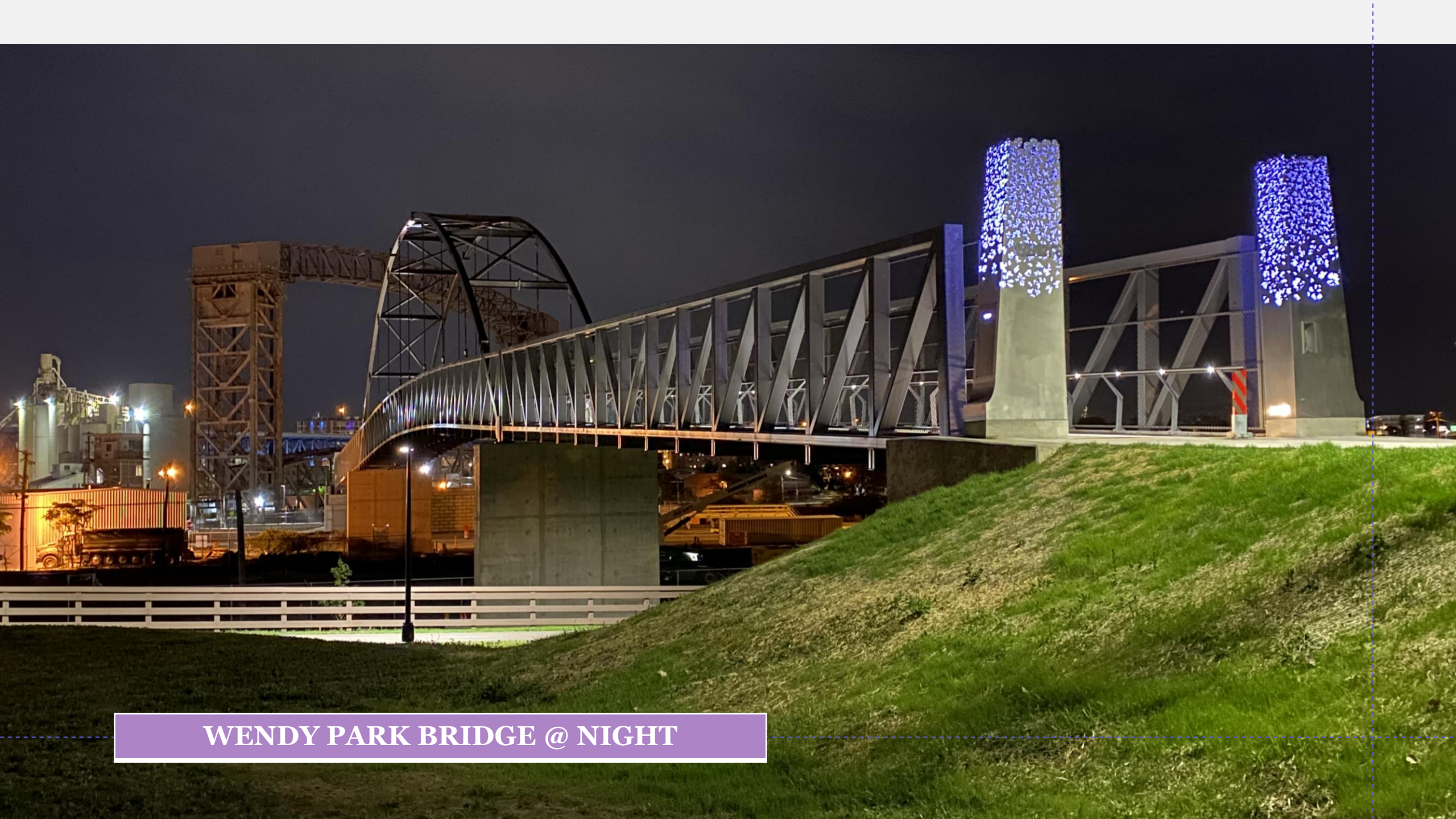
WENDY PARK BRIDGE @ NIGHT