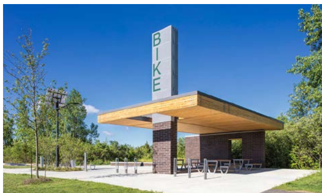
The Wilson Road Park trailhead

The City of Columbus opened the new Wilson Road Park trailhead last year along the Camp Chase segment in Franklin County. The trailhead, shown below, includes shelter, drinking water, a tool kiosk, and restrooms.