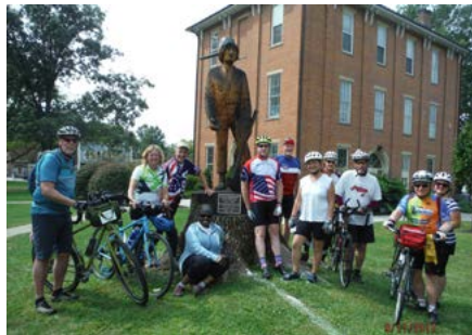
Riders of the 2017 Adventure Ride at Sunbury's Johnny Appleseed statue

As of March 1, the 2018 Adventure Ride has sold out. To be placed on the waiting list, contact ohioerietrail@gmail.com